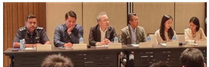
Open discussion panelists at the 2022 SCIC-Joint Agencies Dialogue

As part of the long-standing partnership with the Singapore Chemical Industry Council (SCIC) to engage organisations / businesses from the Chemical industry, CPD has established regular platforms such as the annual webinar conducted during the COVID-19 pandemic to keep the chemical industry abreast of the latest regulations on explosive precursors, safety and security threats.